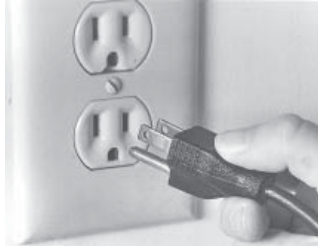
Figure 7-1 Correct

THIS MACHINE IS PROVIDED WITH A THREE-PRONG GROUNDING PLUG. THE OUTLET TO WHICH THIS PLUG IS CONNECTED MUST BE PROPERLY GROUNDED. IF THE RECEPTACLE IS NOT THE PROPER GROUNDING TYPE, CONTACT AN ELECTRICIAN. DO NOT UNDER ANY CIRCUMSTANCES CUT OR REMOVE THE THIRD GROUND PRONG FROM THE POWER CORD OR USE ANY ADAPTER PLUG (Figure 7-1 and Figure 7-2).