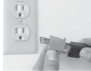
Figure 7-2 Incorrect