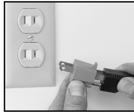
Fig. 5-2 Incorrect

Use rice cooker in properly ground outlets only.