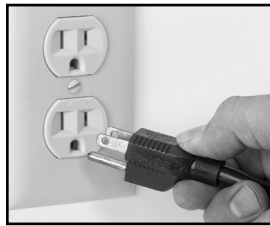
Fig. 5-1 Correct

THIS MACHINE IS PROVIDED WITH A THREE-PRONG GROUNDING PLUG. THE OUTLET TO WHICH THIS PLUG IS CONNECTED MUST BE PROPERLY GROUNDED. IF THE RECEPTACLE IS NOT THE PROPER GROUNDING TYPE, CONTACT AN ELECTRICIAN. DO NOT, UNDER ANY CIRCUMSTANCES, CUT OR REMOVE THE THIRD GROUND PRONG FROM THE POWER CORD OR USE ANY ADAPTER PLUG (Fig. 5-1 and Fig. 5-2).