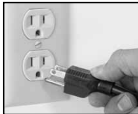
Fig. 7-1 Correct

THIS MACHINE IS PROVIDED WITH A THREE-PRONG GROUNDING PLUG. THE OUTLET TO WHICH THIS PLUG IS CONNECTED MUST BE PROPERLY GROUNDED. IF THE RECEPTACLE IS NOT THE PROPER GROUNDING TYPE, CONTACT AN ELECTRICIAN. DO NOT, UNDER ANY CIRCUMSTANCES, CUT OR REMOVE THE THIRD GROUND PRONG FROM THE POWER CORD OR USE ANY ADAPTER PLUG (Fig. 7-1 and Fig. 7-2).