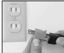
Fig. 7-2 Incorrect