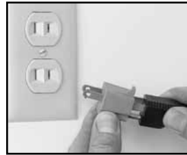
Fig. 6-2 Incorrect